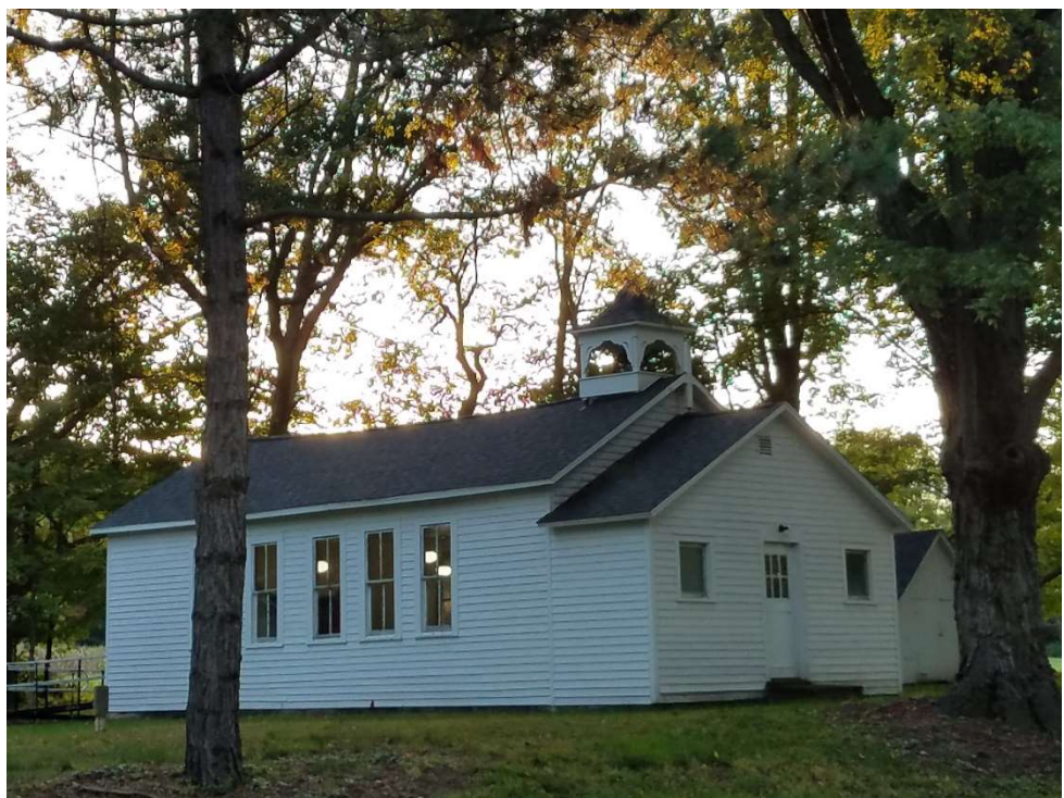
SOUTH EVERGREEN SCHOOL – OCTOBER 2019