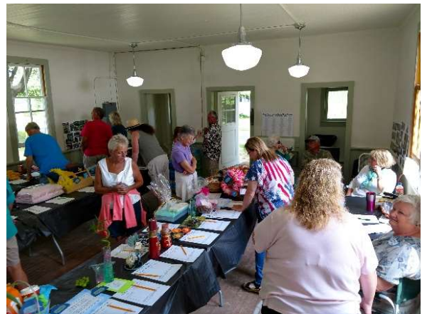
A silent auction raised funds for school renovation.