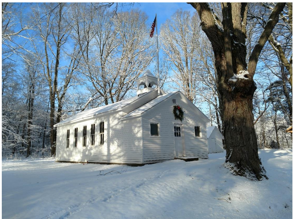
SOUTH EVERGREEN SCHOOL – JANUARY 2018