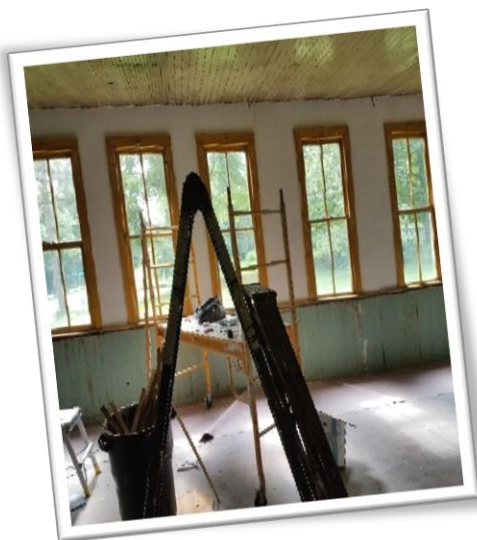
New plaster work on east wall of main school room.