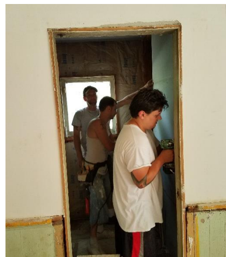
Below: Views of the main room before and after plaster work.

Plaster experts at The Master Plaster Patcher install blue board in the "girls" west bathroom.