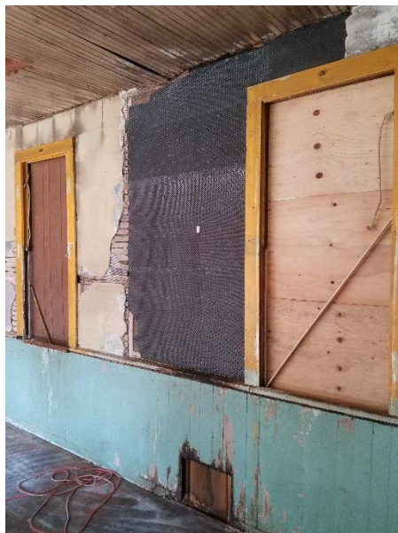
The west wall in the main room, showing the installation of tar paper covered by metal lath to repair damaged areas of the wall before plastering.

The windows have also been removed by volunteers to repair them with new glass, glazing and painting. Coopersville Hardware and Feed re-glazed the windows at a generous discount to the schoolhouse renovation effort.